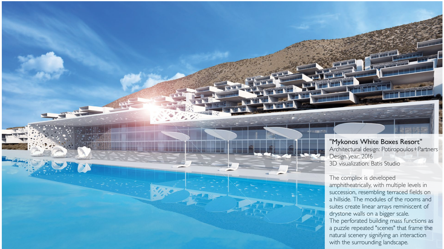
"Mykonos White Boxes Resort" Architectural design: Potiropoulos+Partners Design year: 2016 3D visualization: Batis Studio

The complex is developed amphitheatrically, with multiple levels in succession, resembling terraced fields on a hillside. The modules of the rooms and suites create linear arrays reminiscent of drystone walls on a bigger scale. The perforated building mass functions as a puzzle repeated "scenes" that frame the natural scenery signifying an interaction with the surrounding landscape.